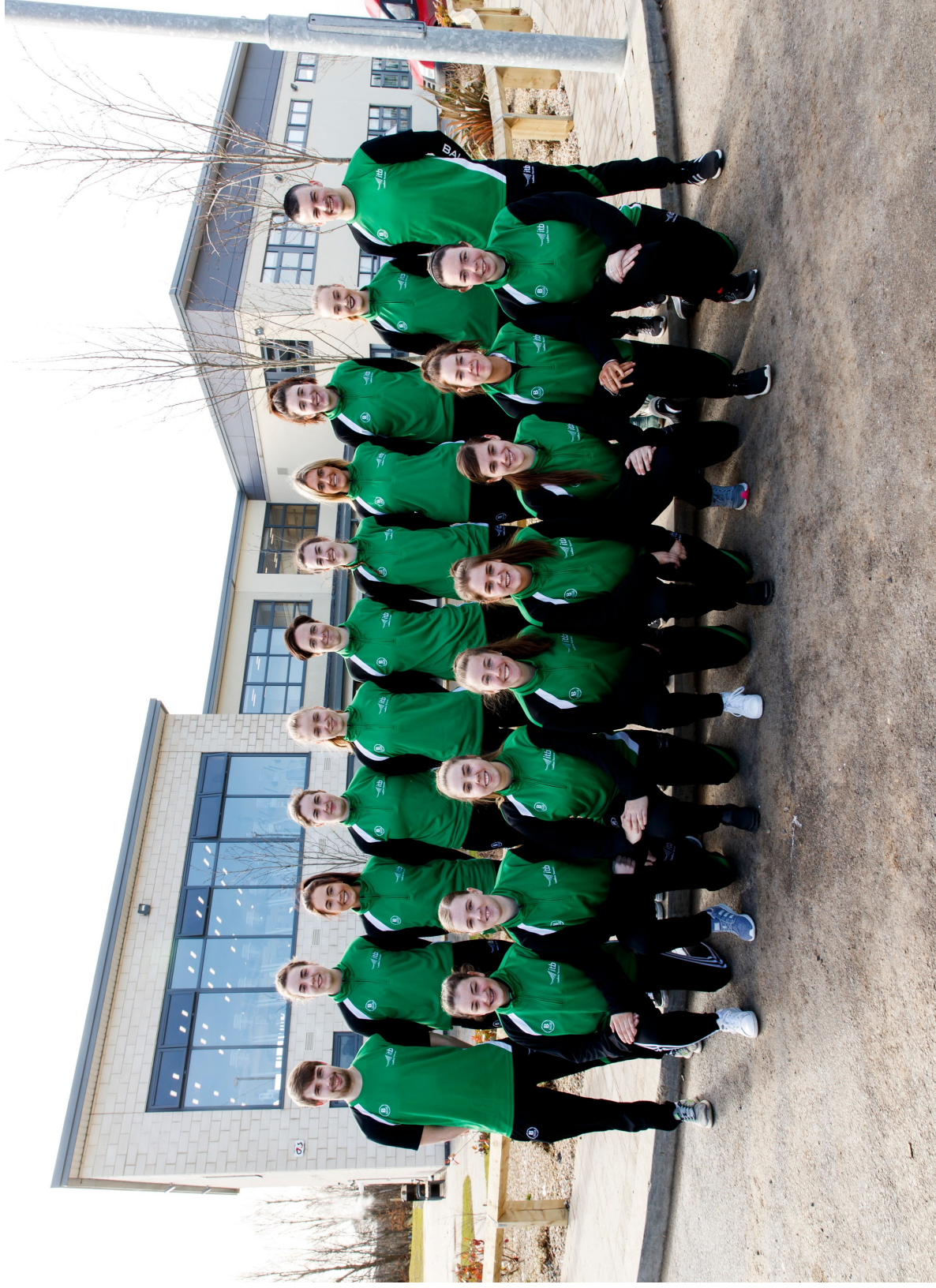
WSCAI DIV2 LEAGUE WINNERS 2017